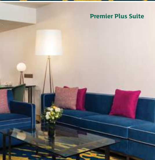
Premier Plus Suite